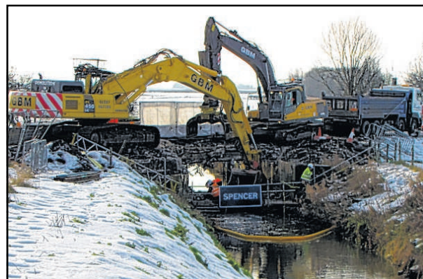
PROGRESS: Spencer is demolishing a bridge near Lissett.

The contract follows on from the company's delivery of projects to East Riding Council under its framework agreement, including new facilities at Cottingham School, the replacement of bridge structures in and around the A165 and the Bridlington park and ride scheme.